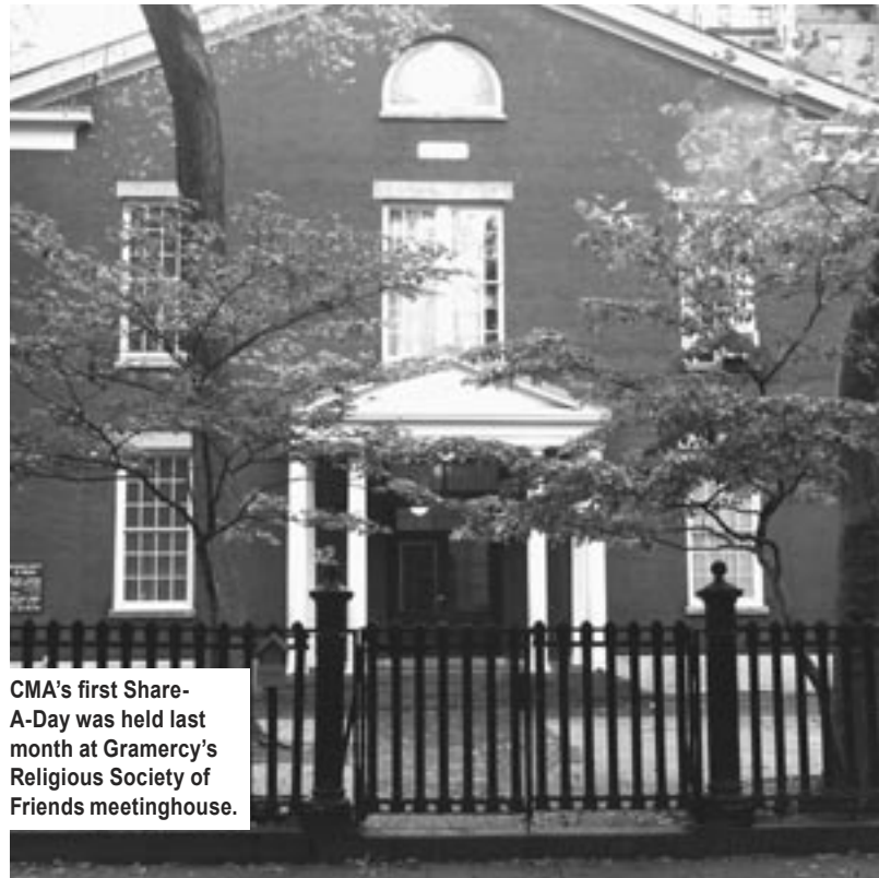
CMA's first Share-A-Day was held last month at Gramercy's Religious Society of Friends meetinghouse.